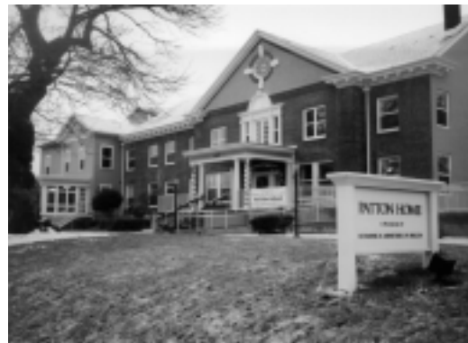
The Patton Home provided affordable, drug- and alcohol-free housing for approximately 60 low-income residents each month in 2004.