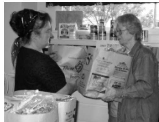
In 2004, the Northeast Emergency Food Program distributed nutritious food to 15,269 people in need.