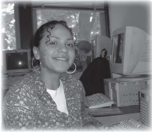
PICS students have access to a computer lab on campus, which was funded by a $15,000 grant from Juan Young Trust.