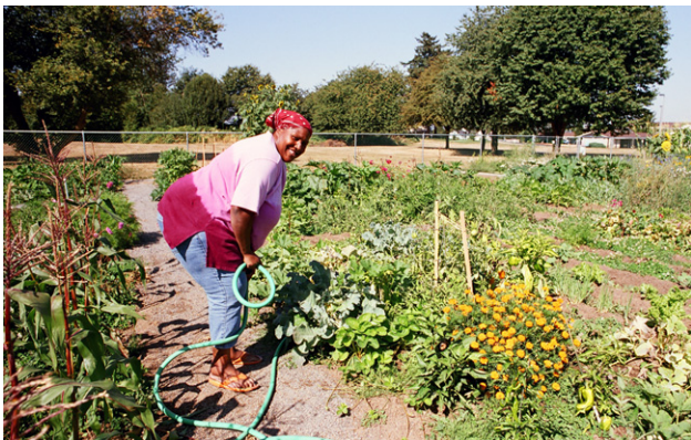
Community garden in New Columbia, north Portland.

Over the spring and summer of 2006, volunteers and students conducted dot surveys at five locations and a youth "photo voice" project at the Seeds of Harmony garden at the New Columbia community. We also began interviews with leaders of various faith communities to learn about food resources and gauge interest in projects. In 2007, we continued building relationships with congregations and community partners. Through these efforts, we recruited several low-income residents to serve on a leadership team.