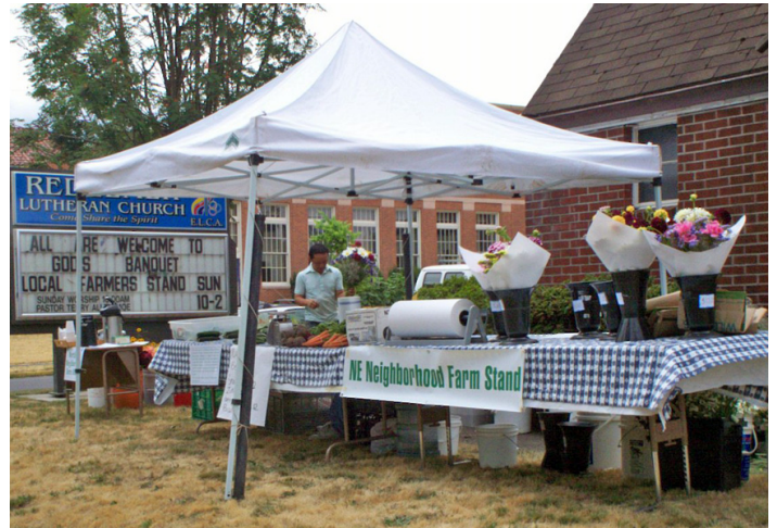
Farm stand at Redeemer Lutheran, NE Killingsworth and 20 th .