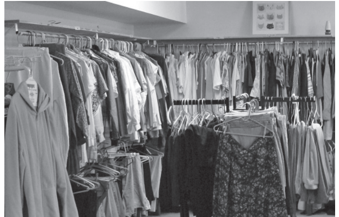
The Clothing Center at NEFP.

In winter, the greatest need was for blankets, outerwear, men's socks and men's pants. Right now