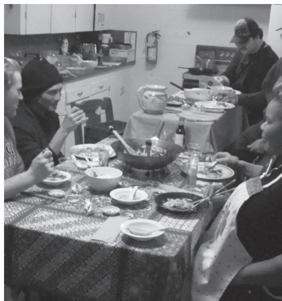
The cooking class chefs dig in on delicious meal.

just how strong a role food has in softening cultural barriers.