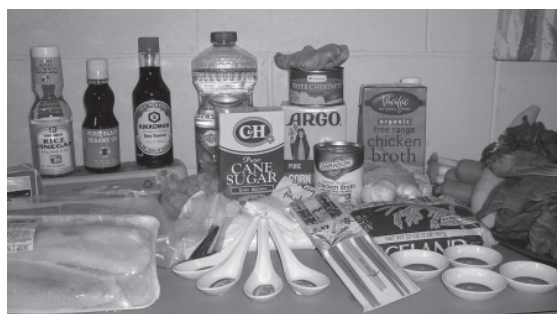
Chefs received a supply of ingredients so they could try their creativity at home.

In these cooking classes, we do more than prepare food. We share stories and history, and discover how the recipes came to be as they are. We talk about our experiences growing up, what our likes and dislikes are, and the recipes we've come across that find their way back to the table. As the instructor, not only was I given the opportunity to do research and learn more about the foods I love to cook, but also to emphasize