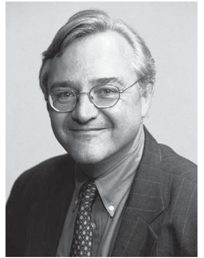
E.J. Dionne, Jr., syndicated columnist for The Washington Post , will be the featured speaker at the 39 th Annual Collins Lecture on Oct. 18.