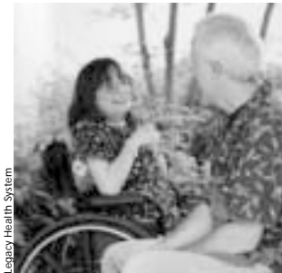
A patient and an EMO staff member enjoy a conversation in the Hopewell House Hospice Center garden.

An integral component of the Compassion Sabbath initiative is the opportunity to provide pastors and faith leaders with