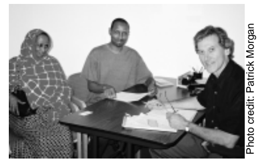
Sponsors Organized to Assist Refugees staff member assisting two of the 63 Bantu refugees resettled from Somalia last year.