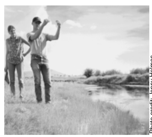
Klamath Basin ranchers point to signs of a restored stream bank as part of a field trip and dialogue for religious leaders on water issues in August 2004.