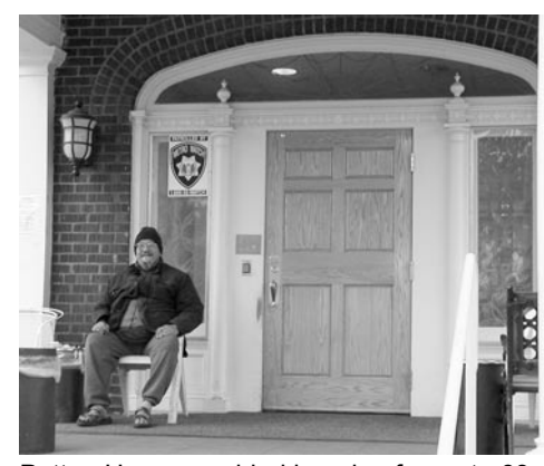
Patton Home provided housing for up to 63 people in recovery from substance abuse or transitioning from homelessness each month during 2005.