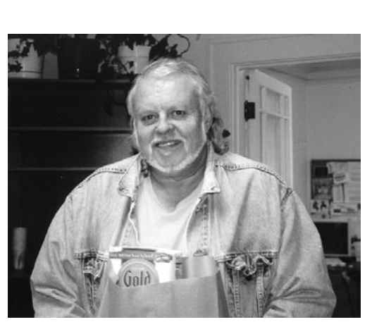
The Northeast Emergency Food Program had a seven percent increase in the number of people served in 2005. A strong holiday giving season enabled the program to cover these needs.