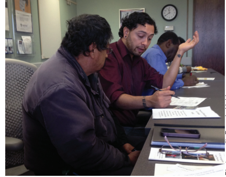
SOAR Immigration Legal Services expanded its statewide work by offering eight Citizenship Days, a DACA Renewal workshop and 20 Citizenship Preparation classes across the state.

■ In 2014, SOAR Immigration Legal Services provided low-cost immigration representation to more than 2,000 immigrants and refugees in application processes.