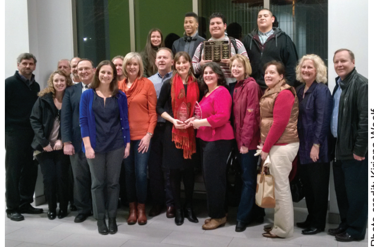
Second Home received the 2014 Beaverton Human Rights Award—with staff, students and home providers in attendance for the award presentation.

• Second Home—a community response to the housing needs of unaccompanied, homeless youth while they attend high school—facilitated housing arrangements last year for 12 students with volunteer host families, providing 70 months of housing and over 6,000 meals.