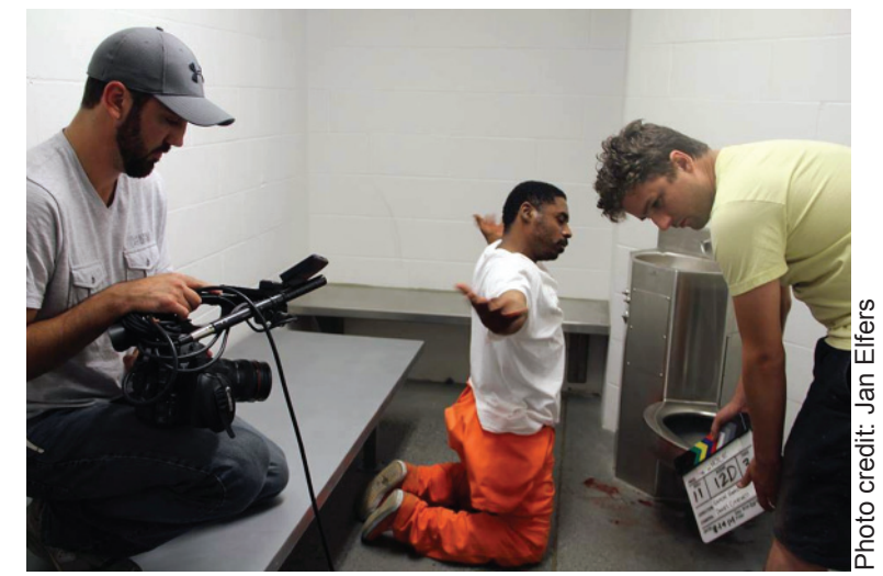
EMO cosponsored "The wHOLE," a pilot for a Web-based series filmed at Wapato jail in Portland by Think Ten Media Group. The film explores criminal justice practices in America, particularly the harsh reality of solitary confinement.

• With the passage of public safety reforms (HB 3194) in the 2013 Legislative Session, criminal justice reform was, and continues to be, a high priority for EMO. We organized prison visits and meetings with the Oregon Department of Corrections to explore how the faith community can foster restorative justice in our criminal justice system.