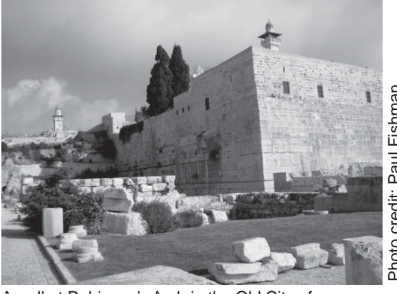
A wall at Robinson's Arch in the Old City of Jerusalem.

The Journey of Peace group is committed to encouraging future trips that will foster similar opportunities for respectful discussion, fact finding and hands-on experiences that serve to humanize one another and open up the possibility for a lasting peace. Contact EMO for more information at (503) 221-1054.