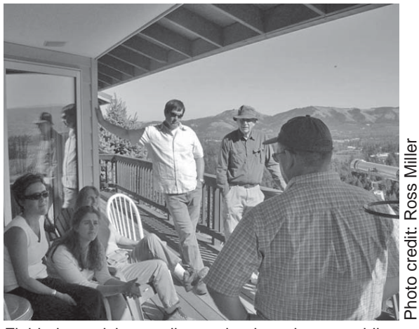
Field trip participants discuss land use issues, while overlooking Hood River Valley land threatened by potential development.

A document on the "Spiritual Values of Mt. Hood Wilderness" was produced by a group of religious leaders who participated in the "Opening the Book of Nature" retreat in September. To view the document and endorse it, go to www. emoregon.org/INEC.htm.