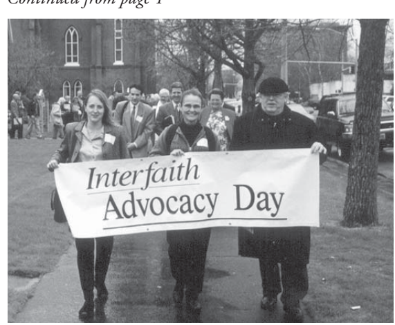
Interfaith Advocacy Day participants march to the state Capitol.

Family Bridge; First Congregational United Church of Christ, Salem; First United Methodist Church, Portland; First Unitarian Church, Hunger Action Group; Fish Emergency Services; HOPE (Helping Other People Eat) Emergency Food Pantry; Interfaith Action for Justice of Central Oregon; Interfaith Council of Greater Portland; Interfaith Disabilities Network of Oregon; Inter-Religious Action Network of Washington County; Islamic Society of Greater Portland; Jewish Federation of Greater Portland; Jubilee Oregon; Lutheran Advocacy Ministry of Oregon; Northwest Portland Ministries; Oregon Center for Christian Values; Oregon Faith Roundtable Against Hunger; Oregon Farm Worker Ministry; Oregon-Idaho Annual Conference of the United Methodist Church, Bishop's Initiative to Eliminate Hunger; Oregon Synod of the Evangelical Lutheran Church in America; Portland Jobs with Justice, Faith Labor Committee; Presbytery of the Cascades, Peacemaking Unit; St. Luke Lutheran Church; St. Philip Neri Catholic Church, Peace and Justice Commission; St. Philip the Deacon Episcopal Church; SnowCap; Society of St. Vincent de Paul; Spiritual Assembly of the Baha'is of Beaverton; Tualatin United Methodist (Hilltop) Church; and Valley Community Presbyterian Church.