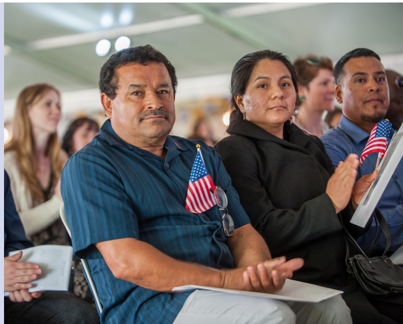
In 2019, SOAR Immigration Legal Services represented 276 immigrants with applications to become U.S. Citizens.

■ Last year, SOAR Immigration Legal Services served a total of 3,228 low income immigrants with legal representation and education services. Over 350 immigrants attended our citizenship preparation classes (in English, Spanish and Russian).