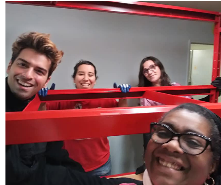
Last year, Northeast Emergency Food Program launched "Operation Uplift" to address necessary repairs and to create a bolder, brighter and more efficient place to work, volunteer, serve and receive.

For I was hungry and you gave me food; I was thirsty and you gave me drink; I was a stranger and you took me in. Matthew 25:35