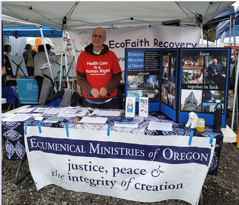
EMO's Creation Justice and EcoFaith Recovery hosted a resource table at the International Climate Strike Festival .