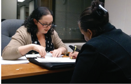
Last year, SOAR Immigration Legal Services staff provided low-cost immigration representation and education services to more than 2,500 immigrants and refugees in Oregon.

Through our visits we observed that many in the community had been victims of immigration fraud and had not had