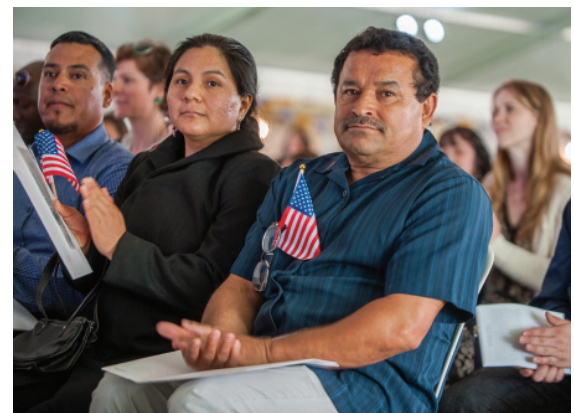
Several Oregon nonprofits, including EMO's SOAR Immigration Legal Services, are launching a program this fall to ensure all immigrants facing deportation have legal representation.

This model, once fully funded, will allow the partnership of nonprofits to collectively provide attorneys to all immigrants in Oregon facing deportation. The partnership seeks to join other states—including Washington,