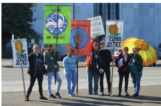
Students from Rosemary Anderson Alternative High School rally for climate justice in Salem.

This project was made as a partnership between Ecumenical Ministries of Oregon, Rosemary Anderson High School and Wagging Tale Productions, LLC, and it was generously supported by East Multnomah Soil & Water Conservation District through their grant