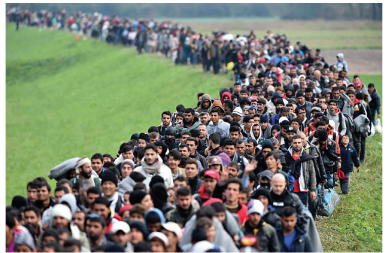
There are now close to 250 million migrants worldwide, including 68.5 million forcibly displaced people.

closer to home, "urban renewal" programs and the gentrification of Portland's central neighborhoods have turned long-term residents, predominately