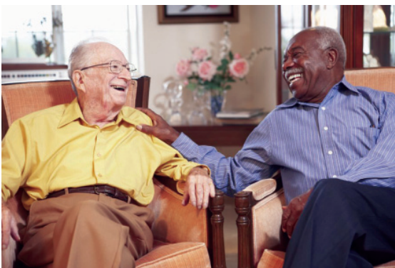
Through homesharing, clients not only gain stable housing but also the opportunity to build community with their housemate and improve their health.

When two people find a match, the benefits go far beyond housing. Research by the Center for Disease Control (CDC) indicates that a person's housing condition leads among the top five social determinants of health. Economic status and social community also affect one's health greatly. Through homesharing, clients